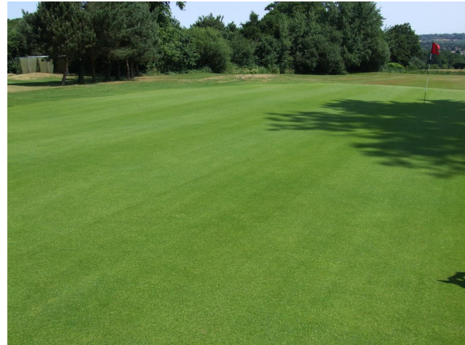
Fungal dry patch alleviated by Symbio Incision

Even distribution of water throughout the rootzone is essential for plant health and consistent playing surfaces during times of drought and deluge.