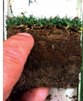
After 83 days

SYMBIO THATCHEATER is a blend of beneficial soil fungi and bacteria specially selected for their ability to rapidly degrade thatch and organic matter, converting it to humus and releasing locked-up nutrients for plant growth.