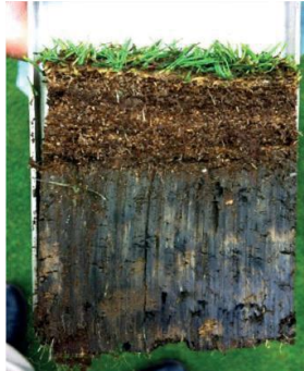
After 9 days