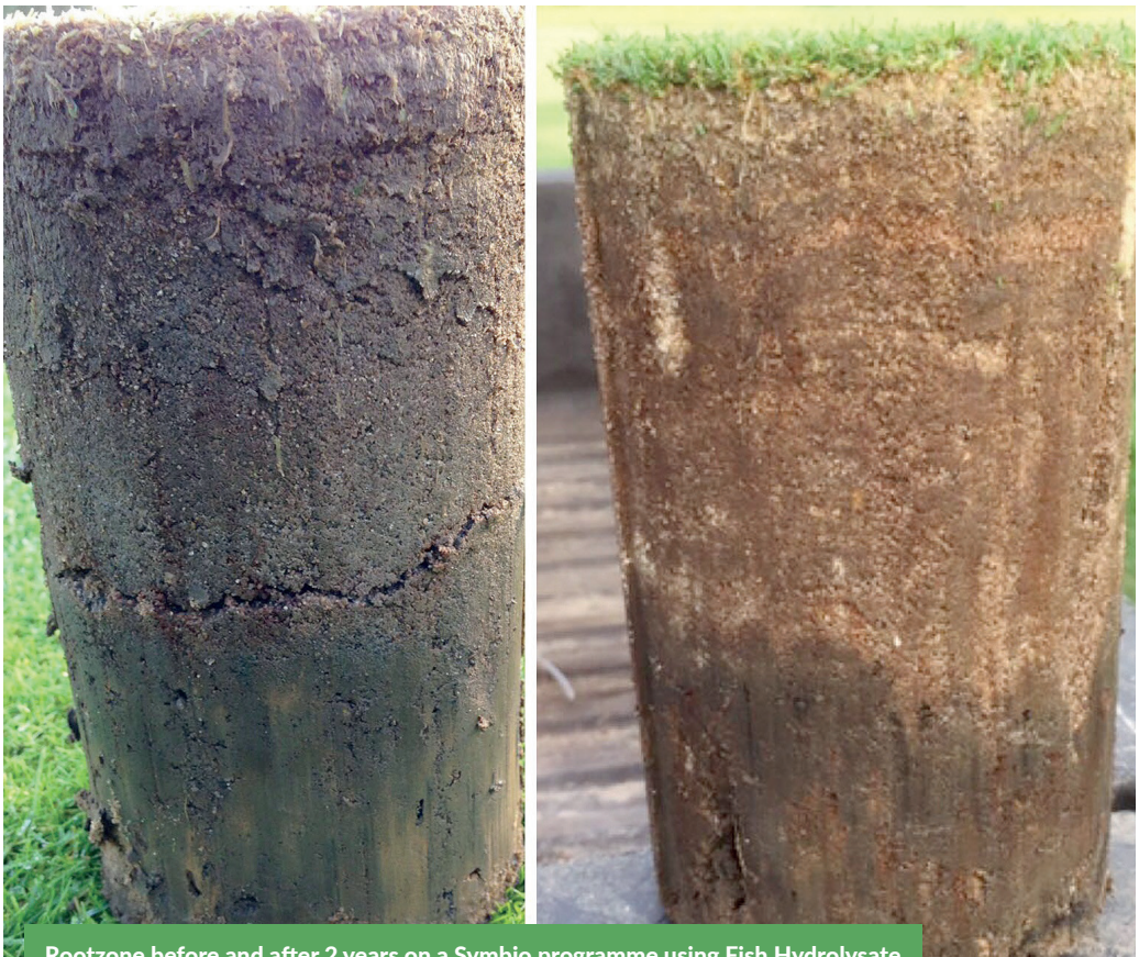
Rootzone before and after 2 years on a Symbio programme using Fish Hydrolysate