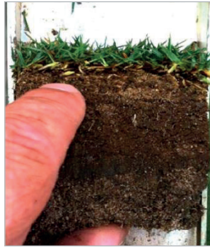
After 83 days