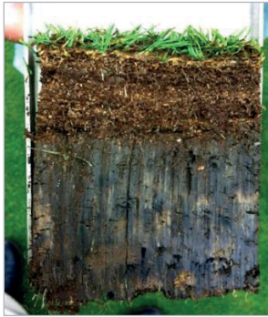
After 9 days