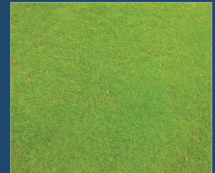
12 weeks later